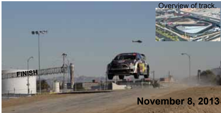
Overview of track.

Shown here is a Car & Driver Flying over the dirt jump portion of the track, approaching the Finish line, behind and to the left of the car.